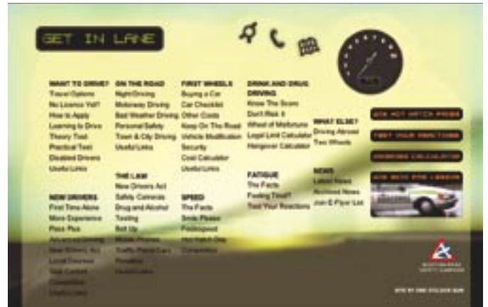
The home page reflects the needs of the target audience.