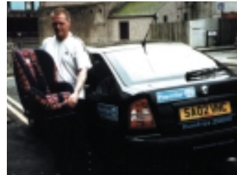
One of the Taxi Drivers from Premier Taxis in Dumfries shows off one of the safety seats used to transport children of parents using their firm.